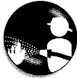
Fire and Rescue Safety