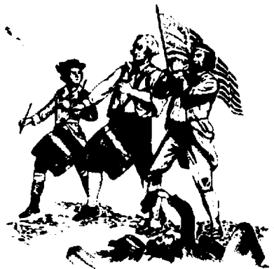
Spirit of '76